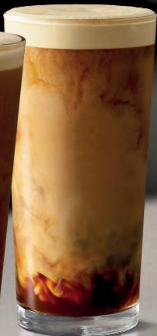
Nitro Caramel Latté 649kJ