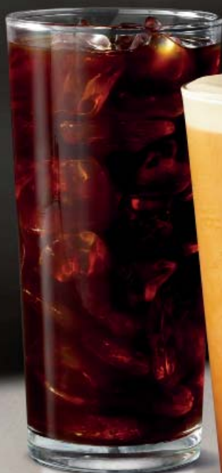
Cold Brew Coffee 57kJ