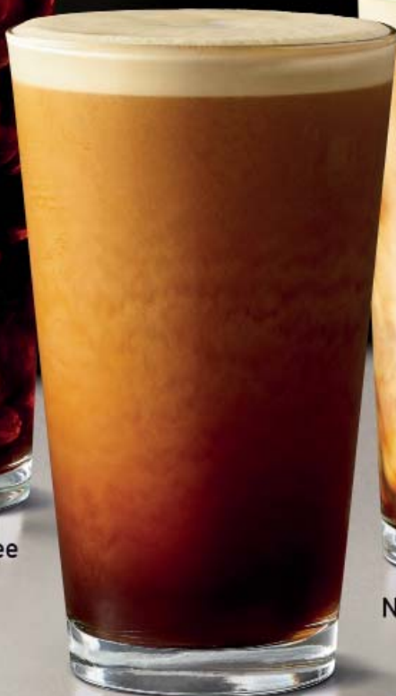
Nitro Coffee 69kJ